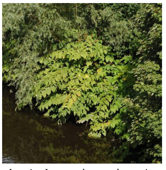
Invasive Japanese knotweed over river

Identifying a non-native species on a site early lets developers assess and cost options for managing, disposal, or destruction.