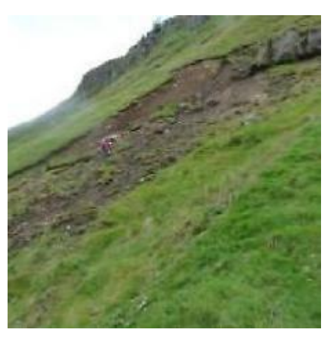
Landslip on steep ground

You should carry out a comprehensive ground investigation to characterise the ground conditions. Important information for track construction comes from peat/topsoil probing, trial pitting, in-situ shear vane tests, and particle size distributions. This information provides key details to allow a full understanding of the ground make-up.