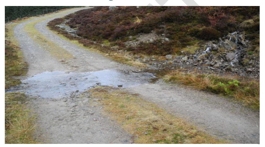
Culverts should be routing water under the track. This track will continue to erode.

Appropriate measures (through the use of track edge drainage, side ditches and culvert options) are required to remove surface water from this area. Appropriate SUDS should be incorporated to reduce run-off rate and improve water quality. Refer to Ciria's SUDS manuals or the local SEPA office for specific advice.