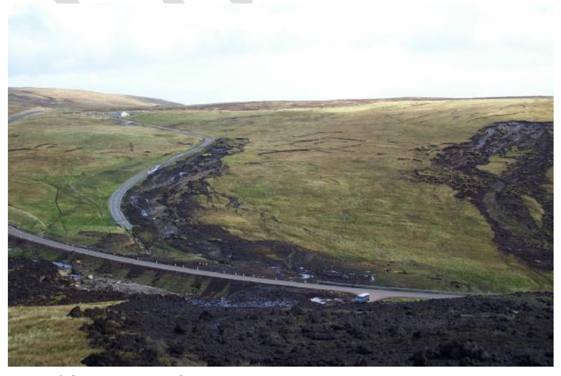
Peat slide impacting road

Peat landslides are a characteristic landscape response of peat uplands to