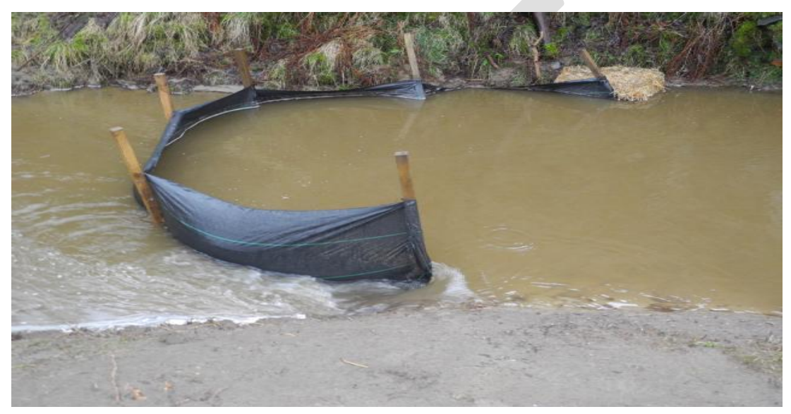
Example of poor practice. Silt fencing is poorly located and is being totally overwhelmed, providing no mitigation against silt pollution. Installed mitigation is not working at a point further upstream, closer to the source of the pollution.

You must ensure that the site is finished in such a way as to minimise risks post construction. This should be addressed through suitable construction practices, appropriate drainage, staff training, and monitoring of the site and environmental receptors.