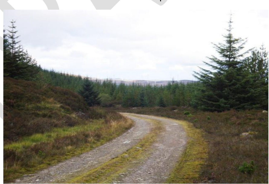
Vegetated centre line on track to soften visual impact

How the track is designed and constructed in the topography, including route, material use, width, passing place location and verge formation can help minimise the impacts of the scheme.