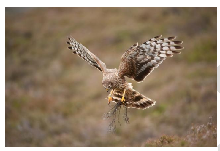
Hen harrier (Circus cyaneus) Of the UK's birds of prey, this is the most intensively persecuted. Please report any sightings to SNH.

SNH can <u>licence</u>, for certain specific purposes, actions that would otherwise constitute an offence against a protected species.