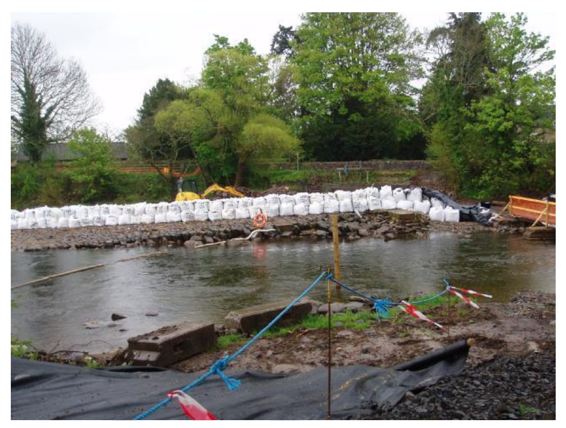
Isolating work area to prevent pollution of the main river downstream

It is usually necessary to isolate working areas during the construction of these structures. For details of measures you could take to minimise impacts, consult section 3.4 of SEPA's <u>Good Practice Guide: Temporary Construction Methods</u>.